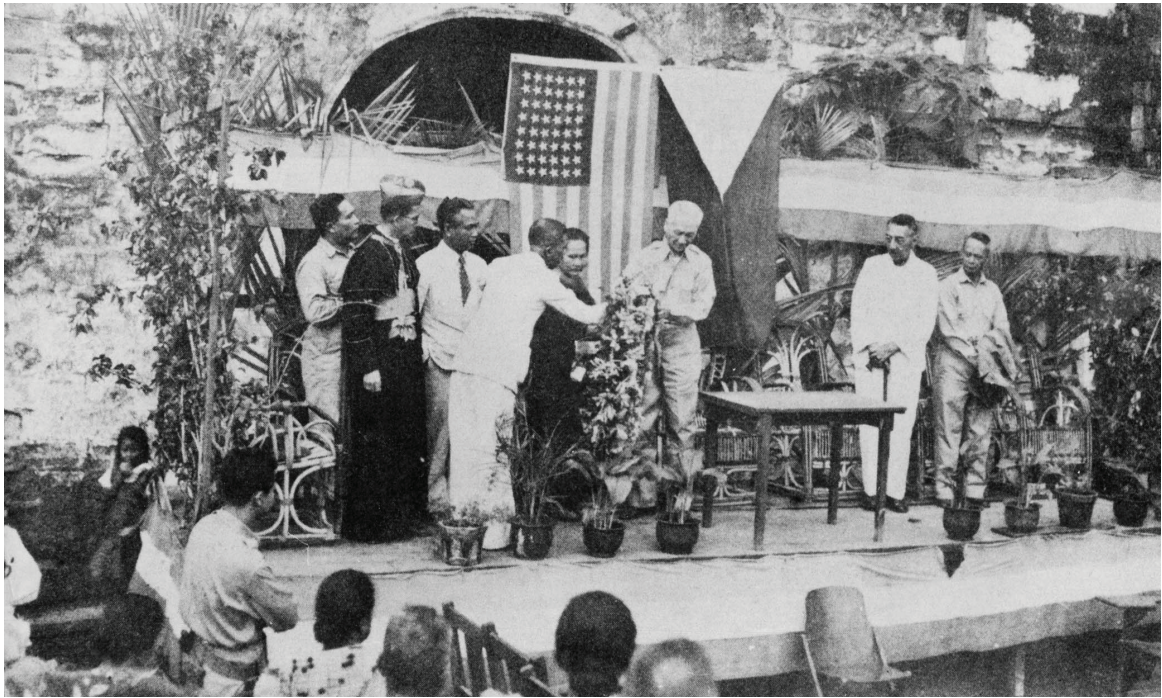
President Sergio Osmeña presiding over rites honoring the National Hero, Jose Rizal, after the landing in Leyte, 1944.